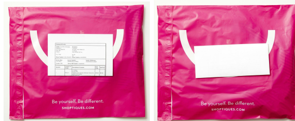
Lightly tape archive doc and commercial invoice to the package.

IMPORTANT: Please make sure these additional shipping documents can be accessed by the shipping provider.