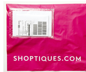
Attach adhesive pouch to front of package.

If you do not have an adhesive pouch, use tape to secure the pre-paid label to the package. Either staple the additional shipping documents together or place in an envelope, then lightly tape to the package.