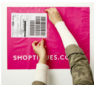
Use tape to secure the shipping label.

If you do not have an adhesive pouch, use tape to secure the pre-paid label to the package. Either staple the additional shipping documents together or place in an envelope, then lightly tape to the package.